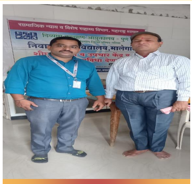
Visit by USGI Official