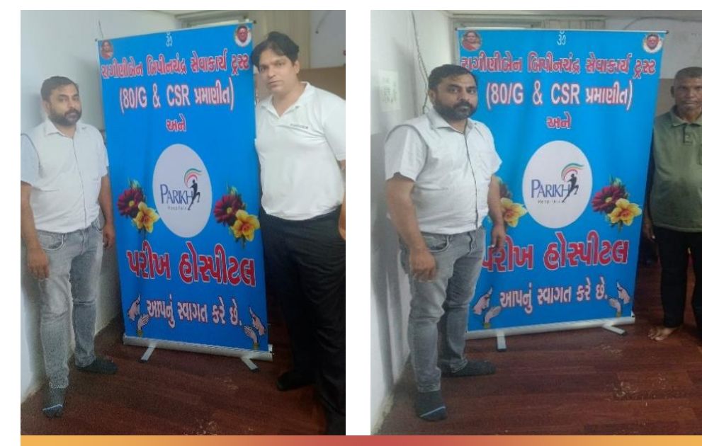
Visit by USGI Official