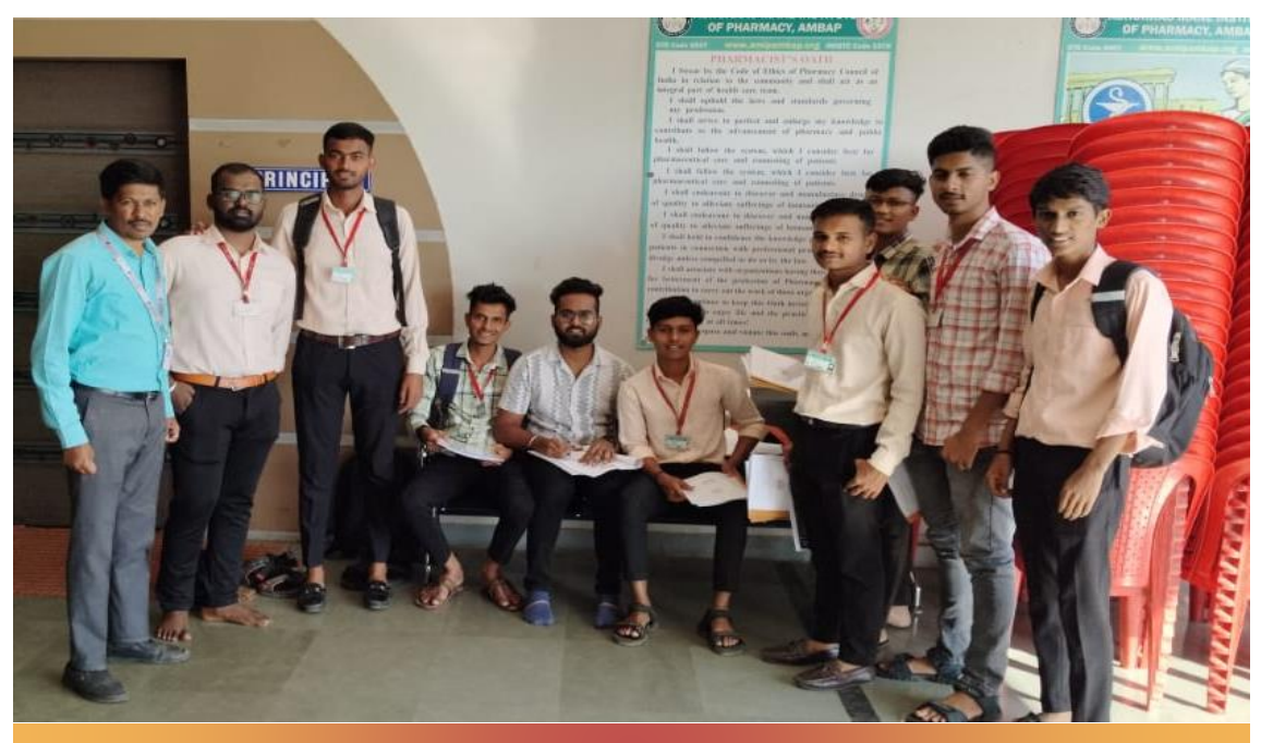
Visit by USGI Official